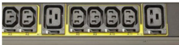
Figure 1. Rack PDUs with IEC outlet grips can reduce the risk of plugs getting bumped loose and leading to server shutdown.

In addition to cable management, power is also another component of rack hygiene, which is where UPSs and PDUs come in. To ensure maximum uptime and improve reliability, network closets should ideally contain redundant UPSs and PDUs to protect both primary and redundant equipment power supplies. However, not all network closets require fully redundant protection; by mixing and matching UPSs with PDUs, administrators can devise the right level of protection to suit their network closet needs. Typically, there are three levels of protection: