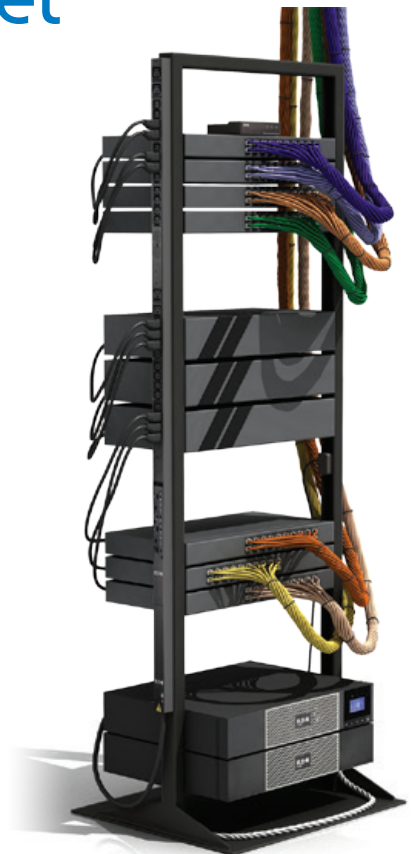
Network Closet Rack

While network closets take on all shapes and sizes, they are essentially an arm of the data center and as an important component of all mission-critical environments, must be organized, protected, and managed efficiently and effectively. IT professionals are charged with keeping the technology infrastructure functioning, even in the face of constrained resources and increasing complexity. By selecting the correct rack and power infrastructure, paired with management hardware and software, organizations can keep their businesses up and running. In this white paper, we go beyond simple how-to advice for keeping IT equipment operational, and discuss how efficiently managing, organizing, and operating network closets saves time, saves money, and avoids risk utilizing the existing space and equipment.